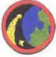
Earth in Space