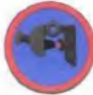
World in Miniature