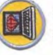
Rocking on the Computer