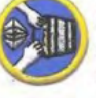
Reaching Across Generations