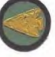
Stone Age Tools & Art