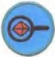
Rocks & Minerals