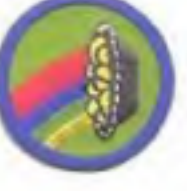
Gold Panning & Prospecting