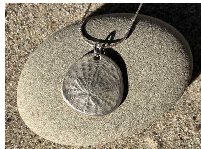
Sterling silver sand dollar

How to make arrangements to purchase tickets or to donate items? It's easy! Just call (805-659-3577) or email me ( jbraceth@roadrunner.com ) and I'm happy to help.