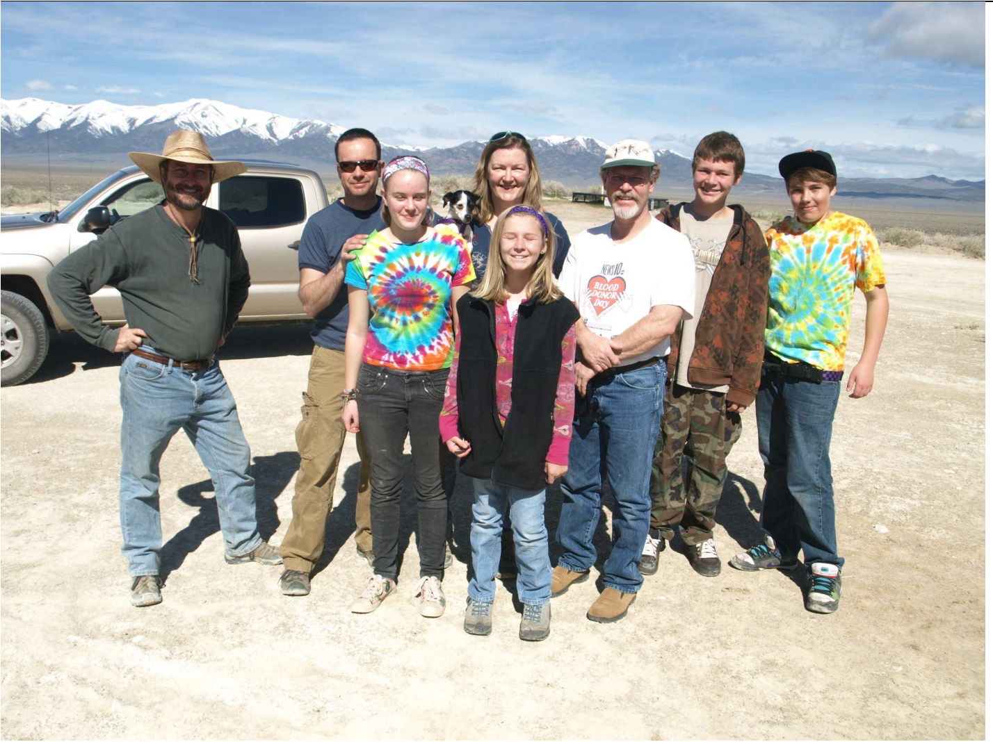
The gang at the Linka Mine on their way to UT