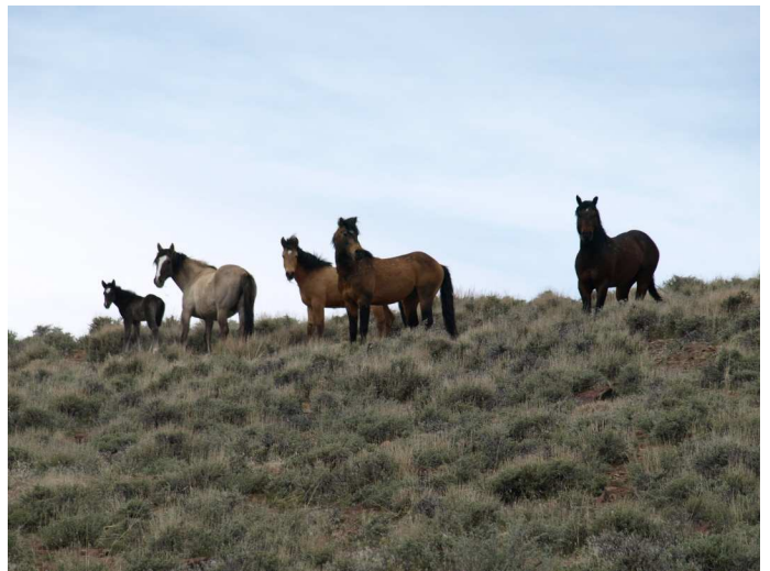
Wild mustangs of Nevada