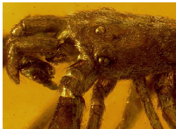
Anterior portion of a spider in Dominican amber.